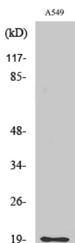
Western Blot analysis of various cells using CD3- \delta Polyclonal Antibody